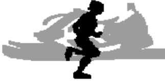
A decent pair of running shoes,